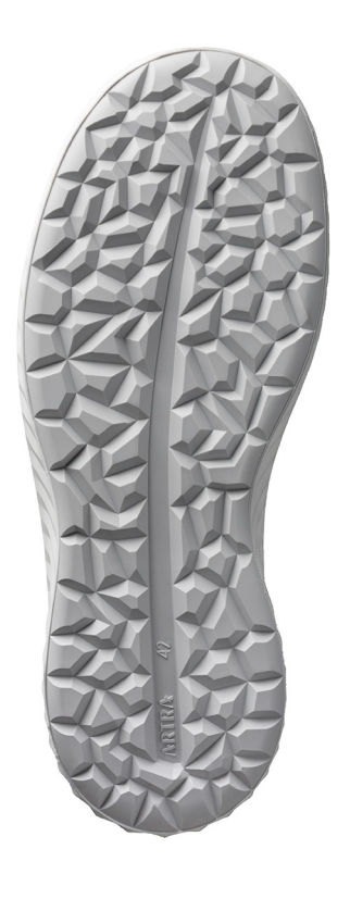
EXCEPTIONAL LIGHTNESS HIGH BREATHABILITY ENERGY RETURN

standard EN ISO 20345:2011 SB A E FO SRC